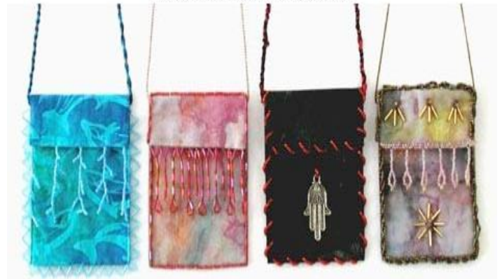
Edging examples covered in PM

We'll also learn to attach beads, charms, buttons, trinkets, & unusual objects. The afternoon focuses on creative edging techniques to decorate quilt bindings, borders, blocks, or outline appliqué motifs with beads!! These bead accents will provide a gently framed or highly dramatic effect to quilts of all construction styles. The techniques can also be applied as a decorative border or edging on curtains, tablecloths, napkins, bed linens, or pillows. Once you recognize the fabulous impact these methods achieve, your existing and in-progress projects will surely tempt you! This class features live video projection, every student has a front row seat! Handwork - no beading experience necessary. Kit fee required $10.00 (contains the beads, embellishment items & beading thread)