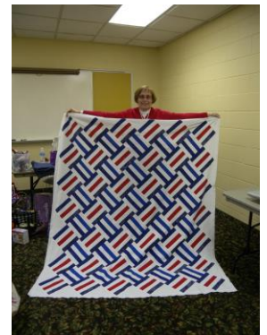
A quilt for someone special to Cindy!