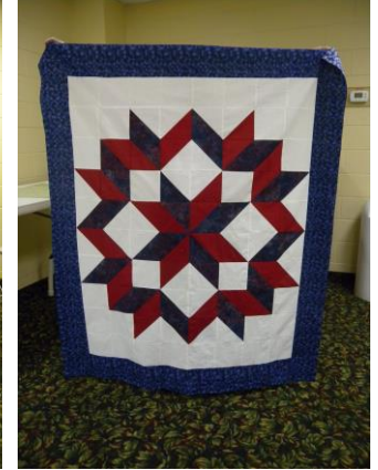
Three of the quilts finished at the retreat.