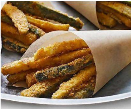
Oven-Baked Zucchini Fries – approx. 8 servings