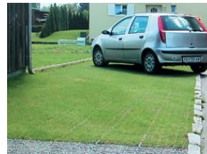
This is a no-no!

Please park in the paved areas around the church building and not in the grass.