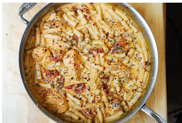
Chicken Mozzarella with Sun-Dried Tomatoes