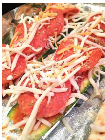
Zucchini Pizza Boats