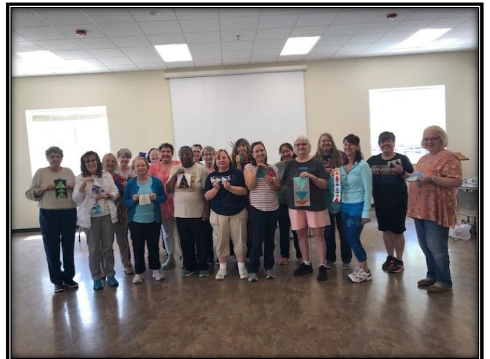
Modern Quilt Workshop