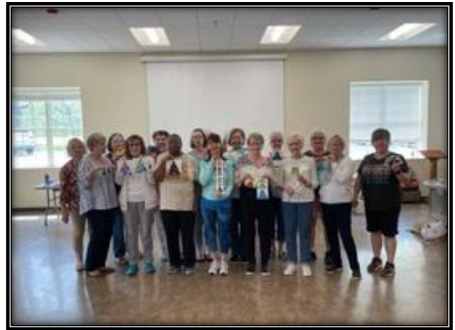
Modern Quilt Workshop