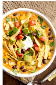
Slow Cooker Chicken Fajita Soup