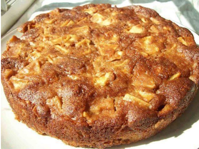
One Bowl Apple Cake