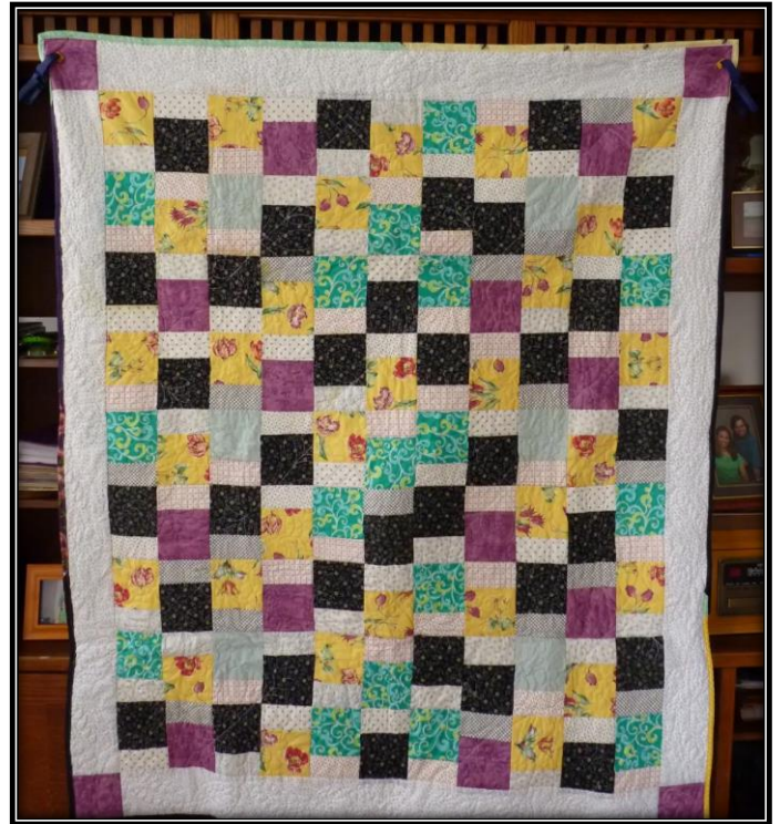
Guild Member Charity Quilt

Daytona Beach, FL • February 22–25, 2023 Branson, MO • March 22–25, 2023 Paducah, KY • April 26–29, 2023 Grand Rapids, MI • September 13–16, 2023 Des Moines, IA • September 27–30, 2023