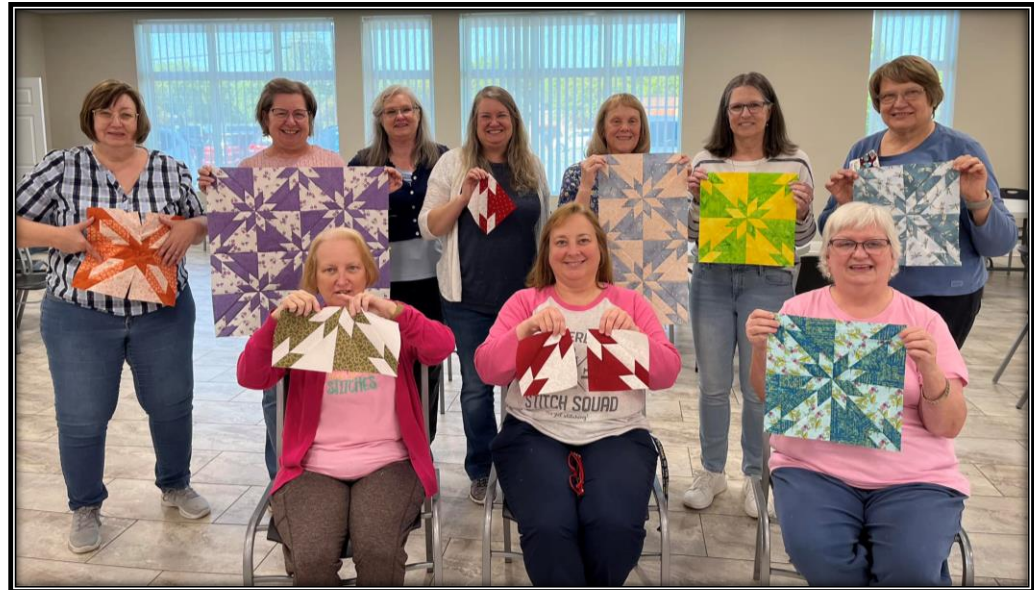
April Workshop- Rapid Fire Hunter's Star